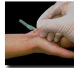
3. Perform arterial puncture. Allow capillary to fill.