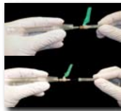
1. Place needle onto ComfortSampler.