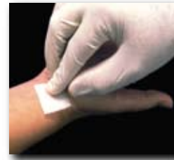
2. Prepare puncture site.