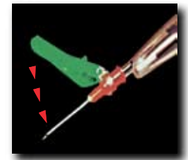
4. Close needle protector by pressing against a firm surface.